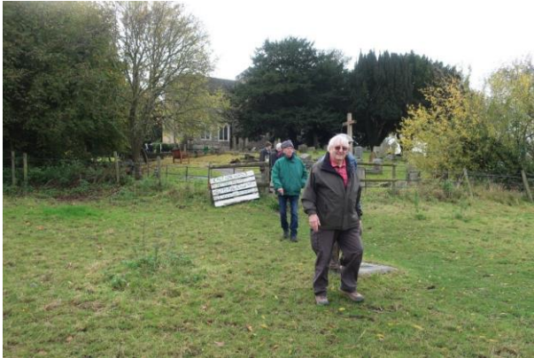
One of the few recent events – HMF October 2020 walk