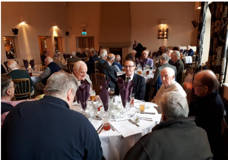
HMF Annual Lunch 2020

We are continuing to plan our Annual Lunch although the scheduled date in January is unlikely at this time of writing, especially as there is growing expectation that London, including Bromley, will be in